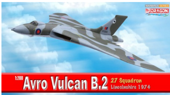
AVRO Vulcan B2 - 27 Squadron Markings

Although all models are shown with 2011 release dates - some are at the preorder stage Dragon Models "WarBird Series" Diecast Models - Prices @US$50.00